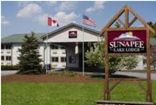
Sunapee Lake Lodge

www.follansbeeinn.com Booking.com 9.0 rating