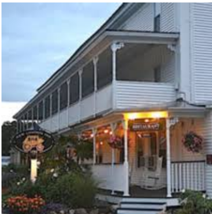
The New London Inn

4 nights- $650- 850 (adjacent to Colby-Sawyer Campus)