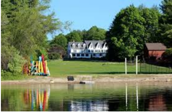
Inn at Pleasant Lake