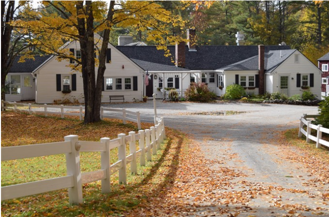
New Hampshire Mountain Inn