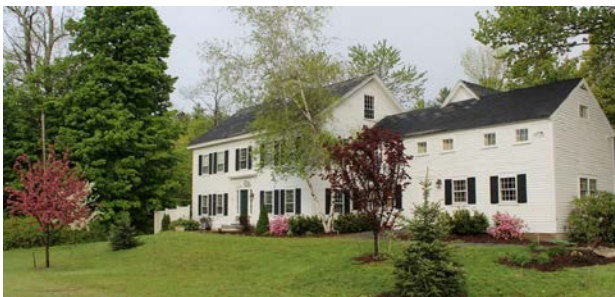
The King Hill Inn