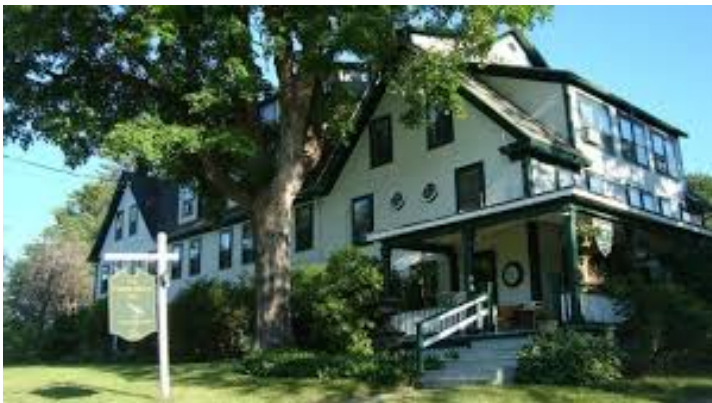
Follansbee Inn on Kezar Lake